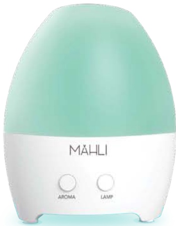
User Guide MDB1000